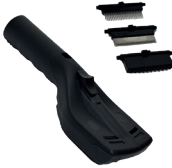
3 in 1 animal brush