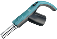
Handle with on/ off switch