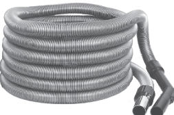
Vacuum hose 7m or 9m