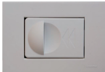
New Line (Ivory)