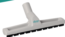
Hard floor nozzle